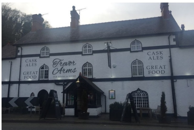
The Trevor Arms in Marford in Wrexham

Some say they've seen them – others say they've spoken to them.