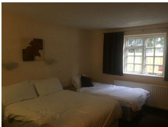
Room 30 at the Trevor Arms in Marford, which is claimed to be home to a vortex

The Grade II listed pub was a significant coaching inn in its day, and also consisted of a stable block which has since been converted into a number of guest rooms.